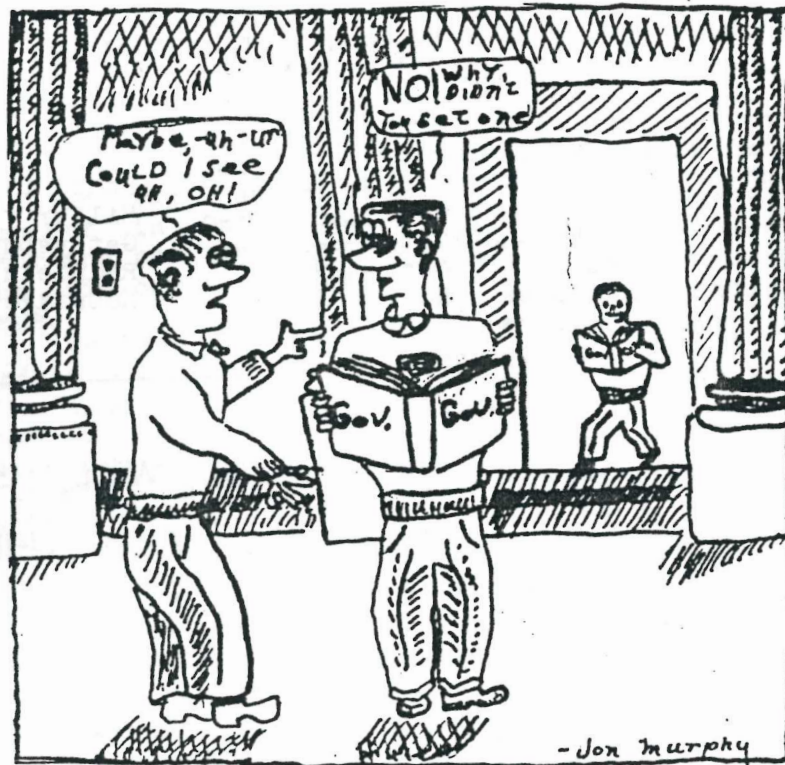
Don't let this happen to you...SUBSCRIBE NOW!!!

One football game past, we all look forward to Homecoming, the basketball season, the tournaments, the Sweetheart's Ball, track, and the Prom.